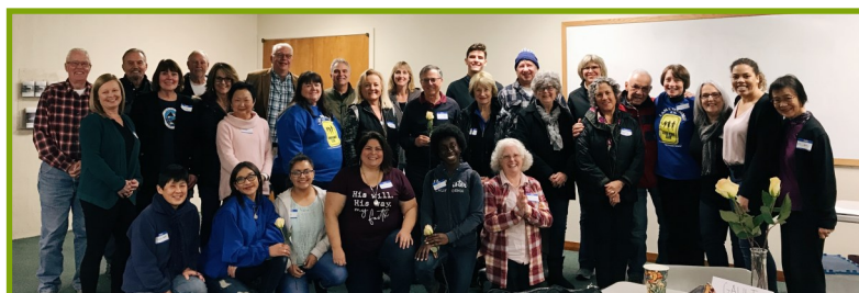
Good News Club team members at the New Year Rally.

“Effective [child] evangelism depends on faithful proclamation of the Word. God will prepare the soil and bring forth the fruit. We must be faithful to plant the seed.”