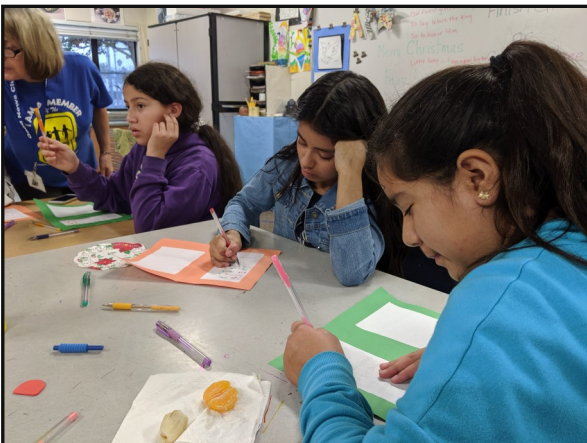
Students at Gault Elementary creating Christmas cards

At DLAMP, things started with a bang by holding a “California snowball fight” (using crumpled recycled paper). The kids learned about Jesus’ birth, sang carols and received an ornament made by one of the Club’s volunteers.