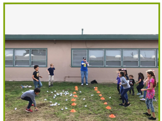
A "snowball fight" at DLAMP in December

My first few months with CEF have been amazing! Thank you to all who have made me feel so welcome. I have been able to visit a few schools since starting and each time I go, I'm blown away by what God is doing in public school through Good News Clubs. I love seeing the genuine hunger the kids have for the Lord!