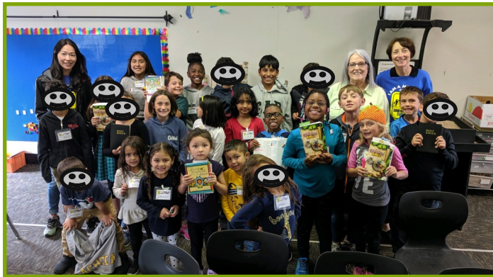
Monte Vista GNC kids and leaders

Do you or someone you know want to share the Gospel of Christ in our public schools? Contact us for more info — centralcoast@cefnorcal.org