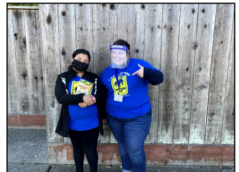
Matchy matchy: kids love their GNC shirts!