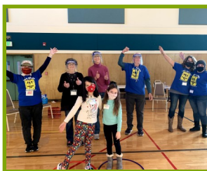
Snapshots of recent Good News Club ministry around the Central Coast

“Children are not a distraction from more important work. They are the most important work.”