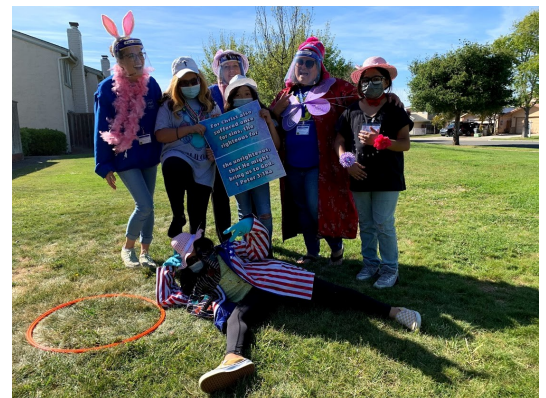
The verse review game included a bit of "dress up"