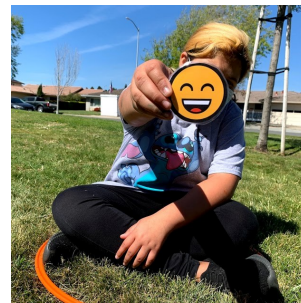
Social Emotional Learning at Good News Club