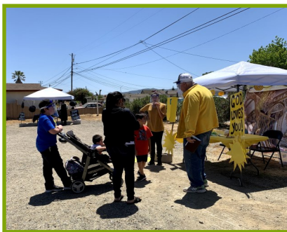
Children hearing the Gospel at a walk-thru outreach in May